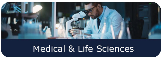
Medical & Life Sciences