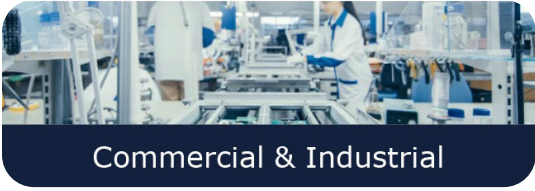
Commercial & Industrial