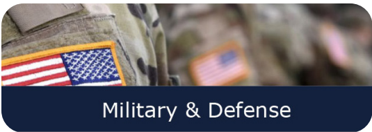
Military & Defense